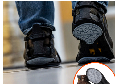
6326 SPIKELESS TRACTION DEVICE - SLIP- & OIL-RESISTANT