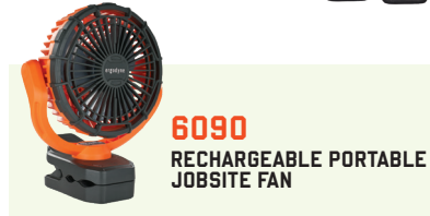
6090 RECHARGEABLE PORTABLE JOBSITE FAN