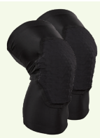
525 LIGHTWEIGHT PADDED KNEE SLEEVES