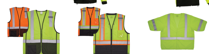
CLASS 2 TYPE R 8210Z-BK MESH HI-VIS SAFETY VEST W/ BLACK BOTTOM CLASS 2 TYPE R 8251HDZ-BK TWO-TONE HI-VIS SAFETY VEST W/ BLACK BOTTOM CLASS 3 TYPE R 8315BA HI-VIS BREAKAWAY SAFETY VEST