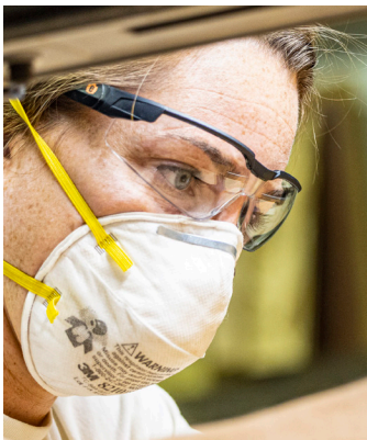
DELLENGER SAFETY GLASSES