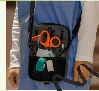
5717 CONVERTIBLE NURSE BELT BAG