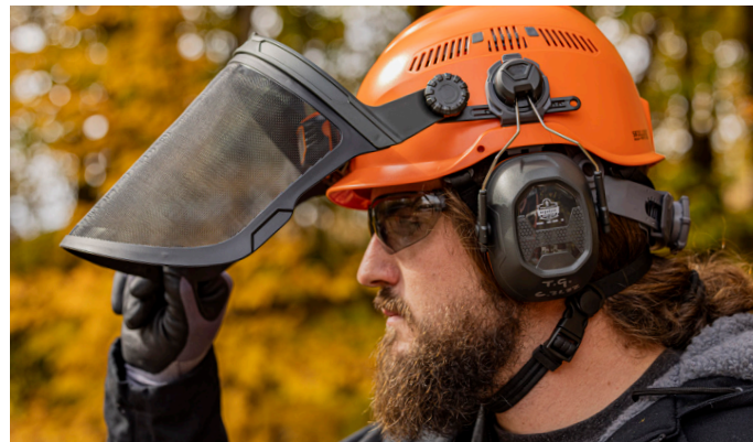
8989 MESH FACE SHIELD W/ ADAPTER FOR HH & SAFETY HELMET