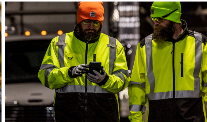
8351 HI-VIS WINDBREAKER WATER-RESISTANT JACKET 8353 HI-VIS SOFTSHELL WATER-RESISTANT JACKET