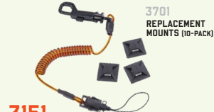
3151 COIL LANYARD SWIVEL HOOK & DETACHABLE LOOP PLUS MINI ADHESIVE MOUNT - 2LBS