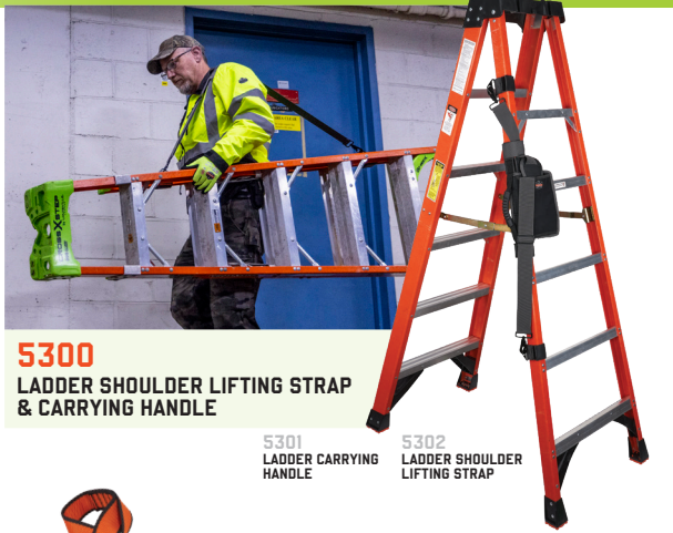
5300 LADDER SHOULDER LIFTING STRAP & CARRYING HANDLE