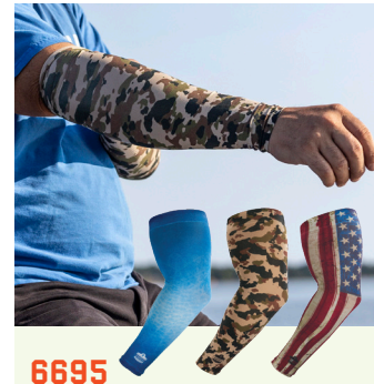
6695 SUN PROTECTION ARM SLEEVES