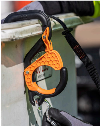
3178 LOCKING AERIAL BUCKET HOOK W/ TETHERING POINT