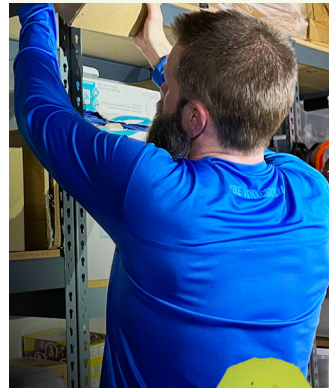
6689 COOLING LONG SLEEVE SUN SHIRT WITH UV PROTECTION