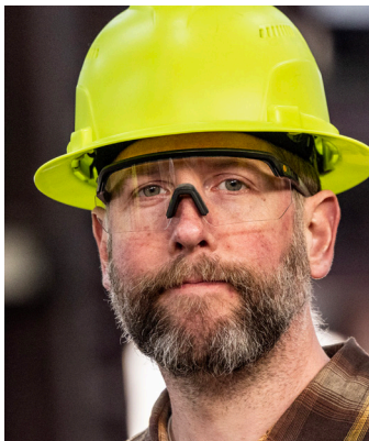
AEGIR SAFETY GLASSES