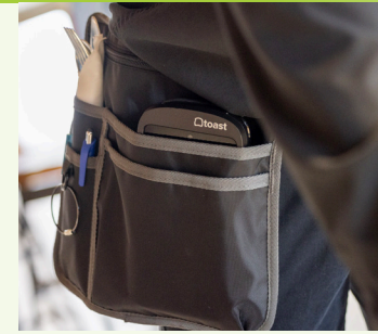
5716 SERVER APRON POUCH WITH POCKETS