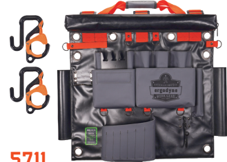
5711 BUCKET TRUCK TOOL BOARD W/ LOCKING AERIAL BUCKET HOOKS KIT