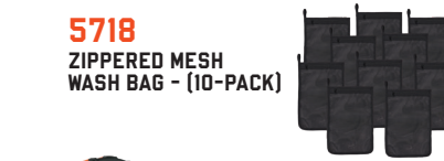
5718 ZIPPERED MESH WASH BAG - (10-PACK)