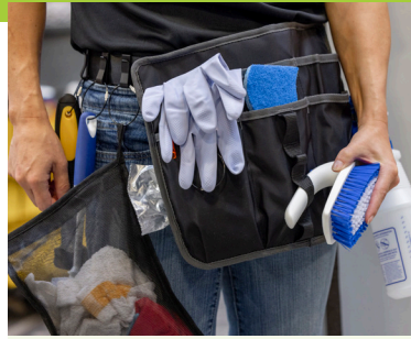
5715 CLEANING APRON POUCH WITH POCKETS