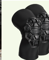
550 PADDED KNEE SLEEVES - 3-LAYER FOAM CAP