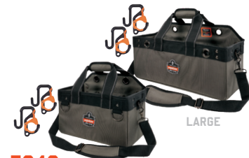
5846 BUCKET TRUCK TOOL BAG W/ LOCKING AERIAL BUCKET HOOKS KIT *AVAILABLE IN TWO SIZES