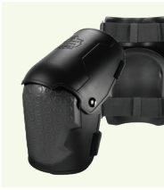
360 HARD SHELL HINGED KNEE PADS