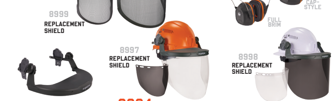
8999 REPLACEMENT SHIELD 8997 REPLACEMENT SHIELD 8998 REPLACEMENT SHIELD